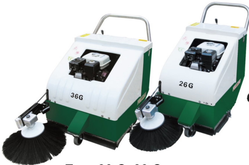
Type 26-G, 36-G (Petrol engine)