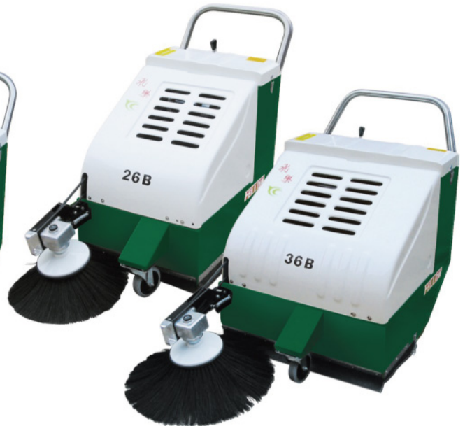
Type 26-B, 36-B (Battery operate)